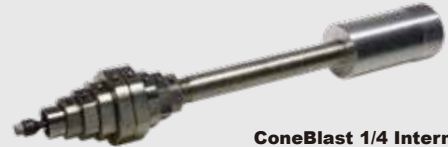
ConeBlast 1/4 Internal Pipe Blaster