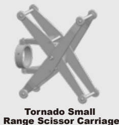
Tornado Small Range Scissor Carriage