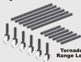
Tornado Mid Range Legs Set