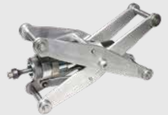
ConeBlast 1/2 with Carriage