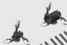
Tornado Mid Range Carriage Set