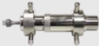
ConeBlast 1/2 Internal Pipe Blaster