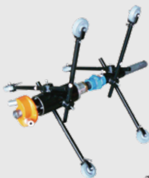
Tornado Large Range Carriage Set

Tornado Tool Carriages CAT-1004-01 Page 464 to 465