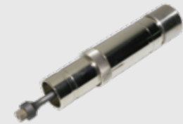
ConeBlast 1/2 Less Carriage