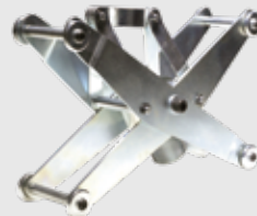
ConeBlast 1/2 Centering Carriage